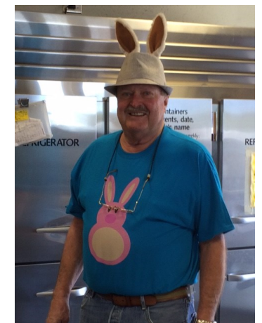
Volunteers to help with brunch always welcome!