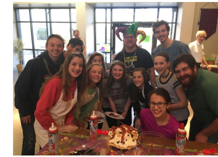
EYC helpers at Shrove Tuesday Pancake Supper Fundraiser