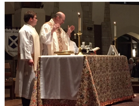
Holy Eucharist at 8:00 am & 10:30 am