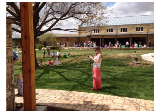
Egg Hunt for kids of all ages!