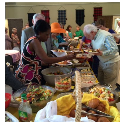
Good food and good fellowship are hard to beat! Bring a friend!